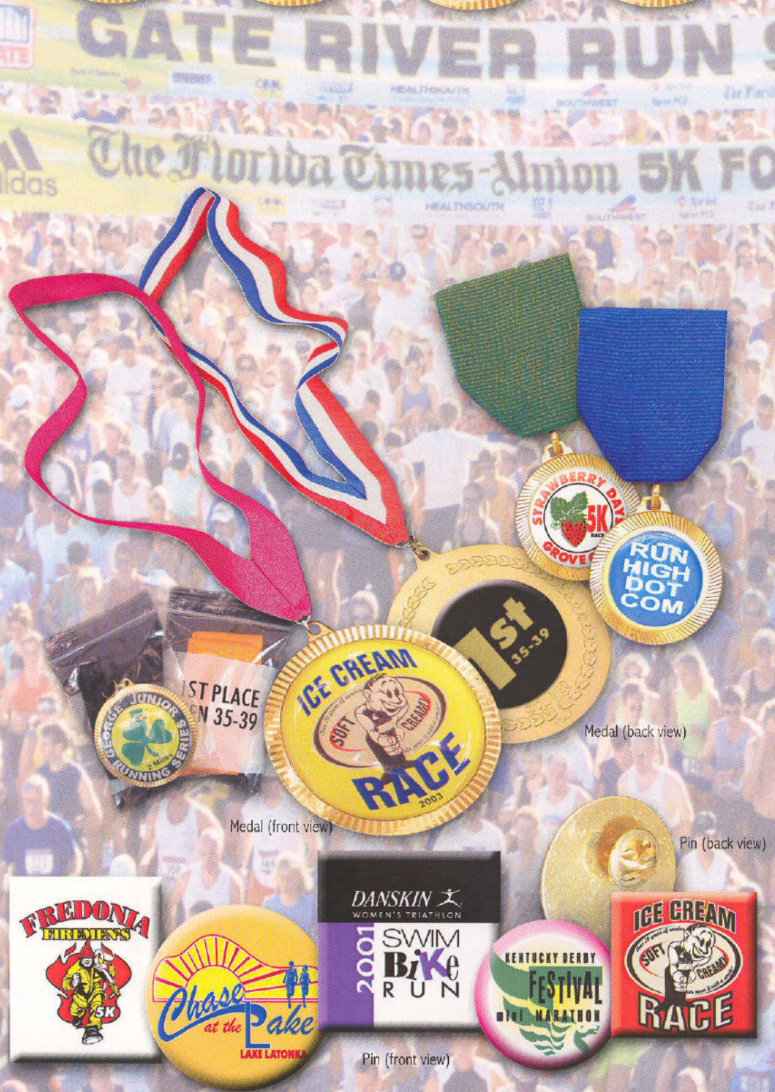
Medal (front view)